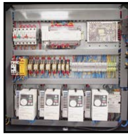
Mitsubishi PLC, Drives & Controls