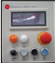
Operator Interface Panel